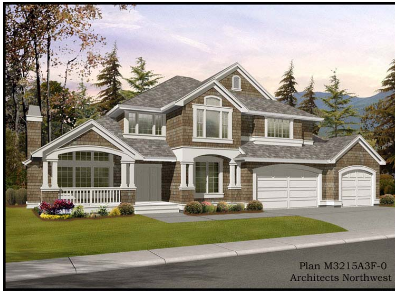
Plan M3215A3F-0 Architects Northwest

A distinctive new neighborhood in Brush Prairie, WA